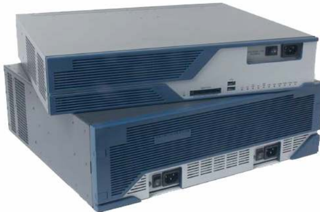
Figure 1. Cisco 3825 and Cisco 3845 Integrated Services Routers

Cisco Systems ® , Inc. is redefining best-in-class enterprise routing with a new portfolio of Integrated Services Routers optimized for secure, wire-speed delivery of concurrent data, voice, and video services. Founded on 20 years of innovation, the Cisco ® 3800 Series of Integrated Services Routers extends Cisco Systems' leadership in multiservice routing, providing customers with unparalleled network agility, performance, and intelligence. By transparently integrating advanced technologies, adaptive services, and secure enterprise communications into a single, resilient system; the Cisco 3800 Series routers ease deployment and management, lower network cost and complexity, and provide unmatched investment protection. The Cisco 3800 Series routers feature embedded security processing, significant performance and memory enhancements, and new high-density interfaces that deliver the performance, availability, and reliability required for scaling mission-critical security, IP telephony, business video, network analysis, and Web applications in the most demanding enterprise environments. Built for performance, the Cisco 3800 Series routers deliver multiple concurrent services at wire-speed T3/E3 rates.